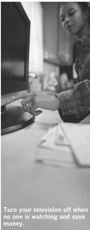
Turn your television off when no one is watching and save money.

For other tips on how to save energy and money, visit the Touchstone Energy Cooperatives energy-saving website, www.togetherwesave.com , or call the efficiency experts at MCREA at 970-867-5688.